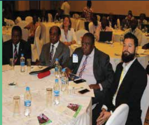
Launch of TVCN in 2018