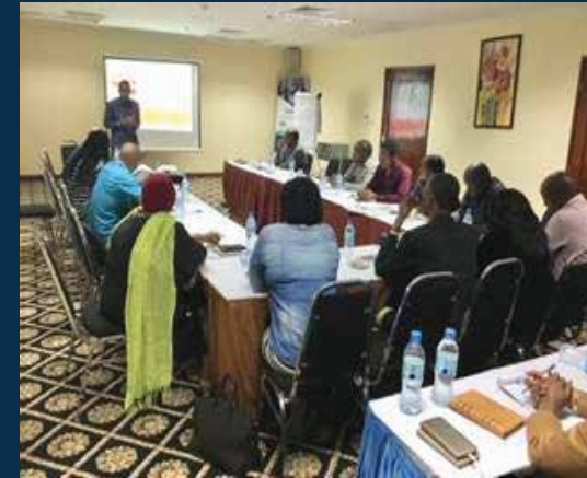
Training to business owners