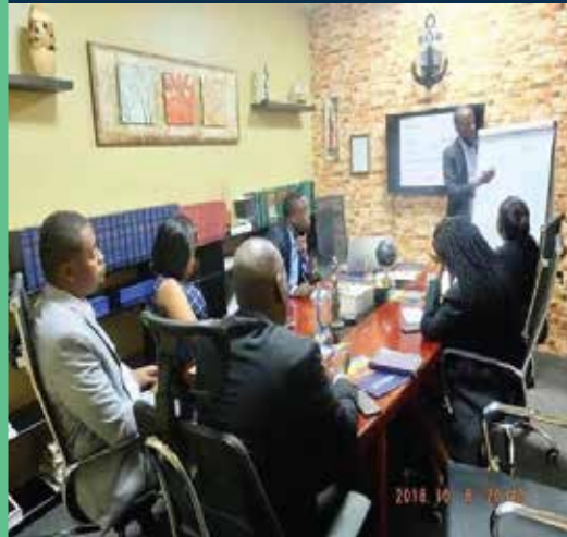
Training to a law firm