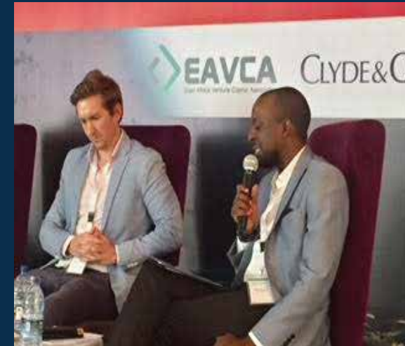
EA Venture Capital Conference